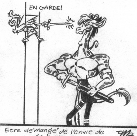
THE se battre