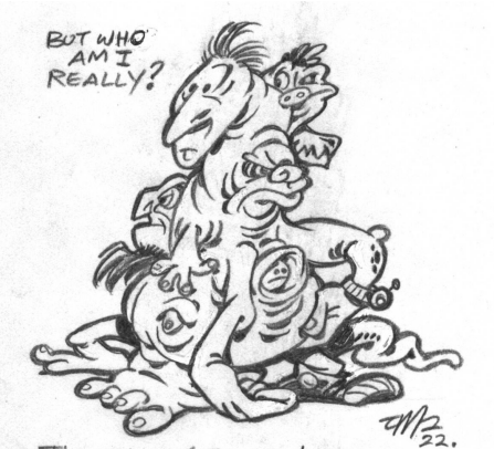
The Thing From Another World has an Existential Moment.